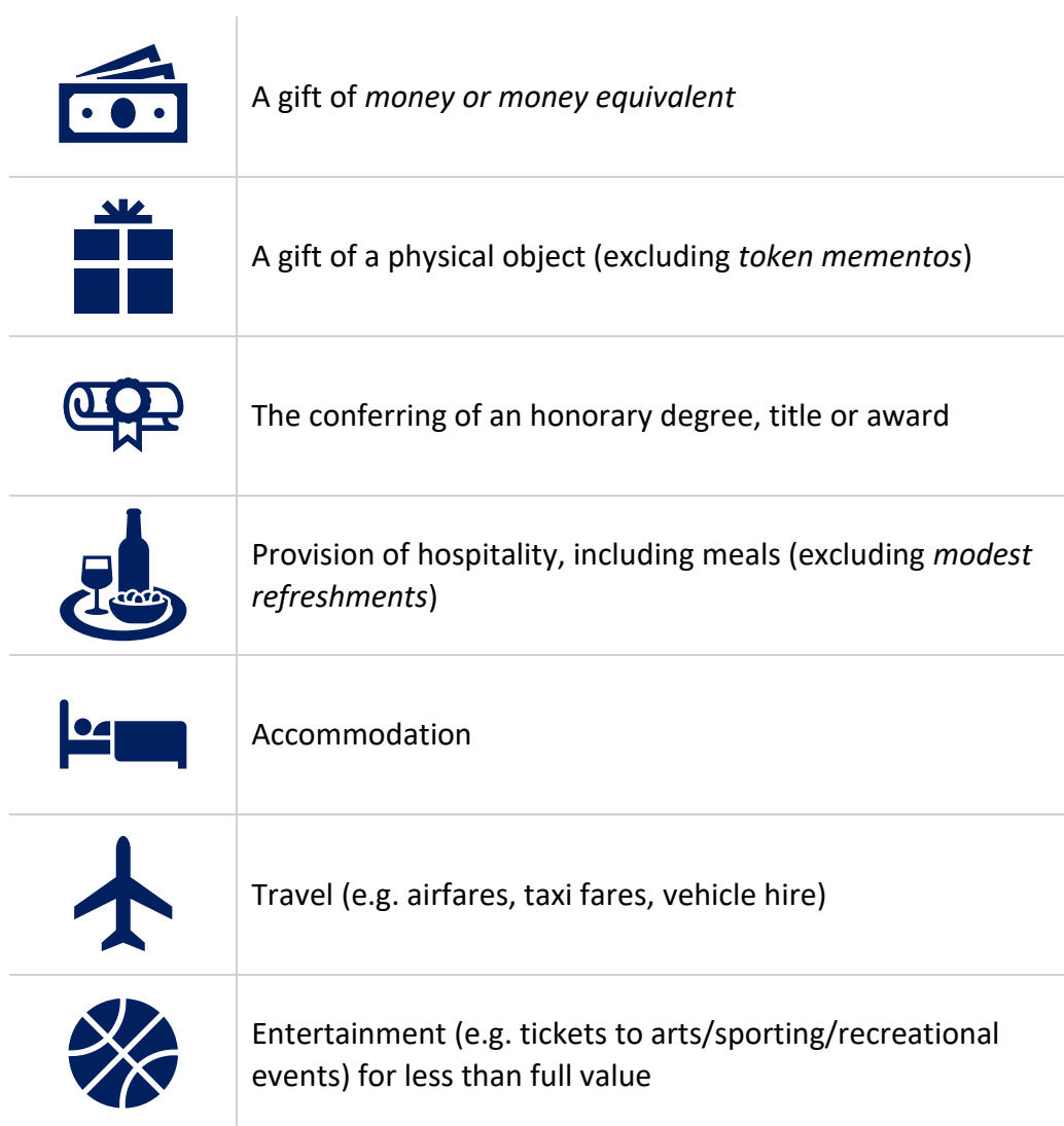
Figure 2: Examples of gifts, benefits and hospitality in the 2016 Policy

Source: Audit Tasmania adapted from the 2016 Policy. 6